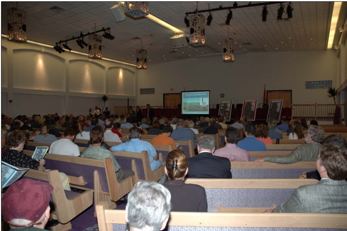
Figure 4-4: A formal presentation of the study results were provided to the public.

A formal presentation to the public began near the scheduled start of the Public Meeting. This presentation a brief review of the study methodology, but primarily focused on the anticipated development that is forecasted to occur and the transportation network that will be needed to address the future demands. Both alternatives were presented to the public and the network differences and forecasted travel demand were compared. Figure 4-4 highlights part of the presentation to the public.