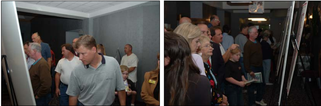
Figures 4-2 and 4-3: Members of the public reviewed boards of information prior to the formal presentation.

A formal presentation to the public began near the scheduled start of the Public Meeting. This presentation a brief review of the study methodology, but primarily focused on the anticipated development that is forecasted to occur and the transportation network that will be needed to address the future demands. Both alternatives were presented to the public and the network differences and forecasted travel demand were compared. Figure 4-4 highlights part of the presentation to the public.